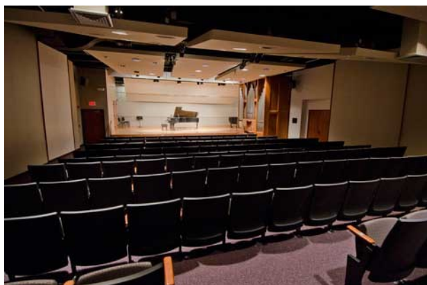
Wilmot Hall, Nazareth College School of Music